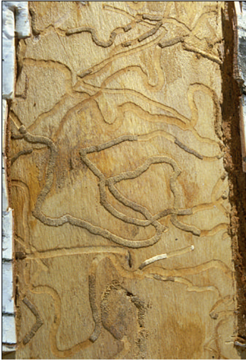
Figure 5. Meandering or zigzag galleries formed under the bark by tunneling larvae.