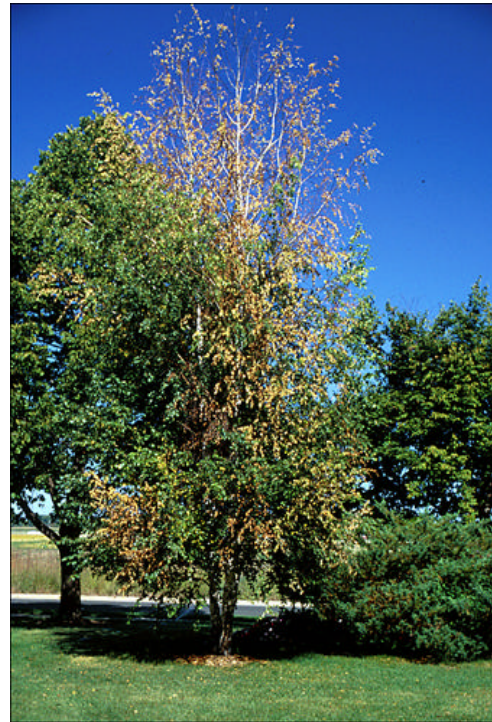
Figure 2. A landscape birch tree infested with bronze birch borers. Branches in the upper canopy are usually affected first.

The condition of host trees is the principal factor in the birch tree and borer relationship. Adult bronze birch borers primarily attack birches that are weakened or stressed by drought, old age, insect defoliation, soil compaction, or a stem or root injury. Birch trees prefer cool, moist growing locations and have a shallow root system that is easily injured by disturbance or dry, hot conditions. Many landscape birch trees are planted in unsuitable habitats and are stressed on a regular basis. Birch trees growing within a forest are stressed by old age, weather events such as drought, or by repeated defoliation. Widespread birch mortality often occurs after these events.