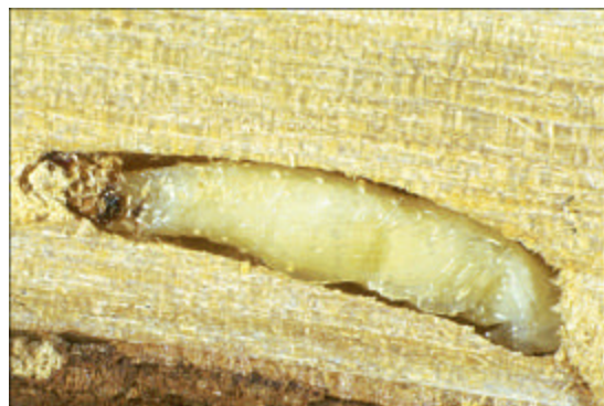
Figure 7. Pupa of the bronze birch borer.