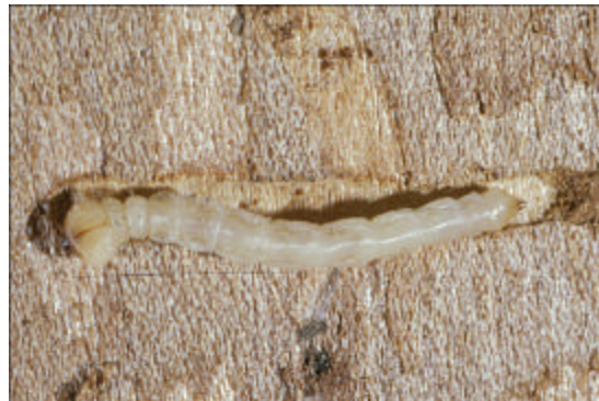
Figure 6. Larva of the bronze birch borer.

Adults emerge from previously infested trees between early May and early June in the southern part of the borer's range and from late June to mid-July further north. Adults in any one location may emerge over a 5 to 6-week period. Adult beetles live about 3 weeks. Therefore, adults may be found on trees during most of the summer.