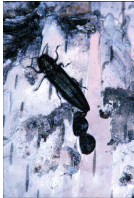
Figure 1. Bronze birch borer adult and two D-shaped exit holes.

Bronze birch borers are known to attack all native and introduced birch species, although birch susceptibility varies. Many varieties of birch species as well as numerous crosses between species are currently planted as ornamentals in North America. Although some varieties are more resistant than others,