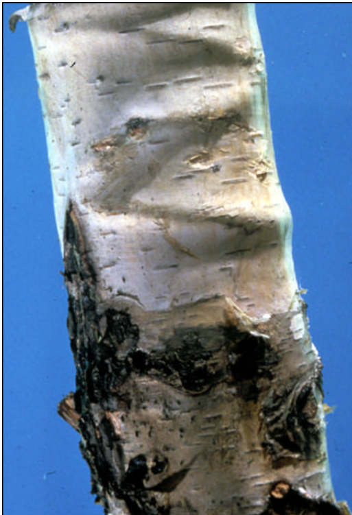
Figure 3. Swellings or bumps formed where a tree has healed over a gallery of the bronze birch borer.

Larvae feed under the bark in meandering galleries (figure 5) or in a series of zigzag patterns that grow increasingly larger as the larvae develop. Galleries are packed tightly with frass (excrement mixed with boring dust). Callus tissue that grows over the larval feeding galleries results in ridge-like swellings or bumps on the bark of previously infested trees (see figure 3).