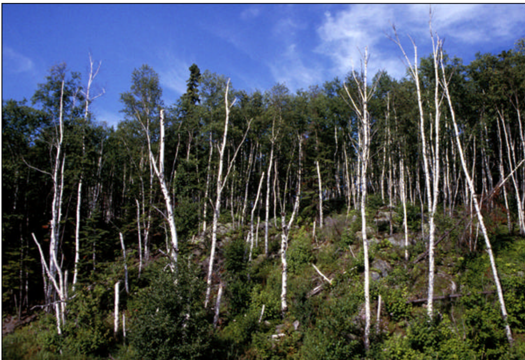
Figure 8. Paper birch killed after a severe regional drought in northern Minnesota.

Bronze birch borers infested and ultimately killed many of these trees (figure 8). A massive dieoff of birch was observed throughout the Great Lakes region in the early 1990’s indicating that many of the existing birch-dominated ecosystems throughout the region were aging and more likely to be stressed by weather events. Developing a mosaic of age classes should reduce bronze birch borer impact over a large area and contribute to the stability of the birch resource within that region.